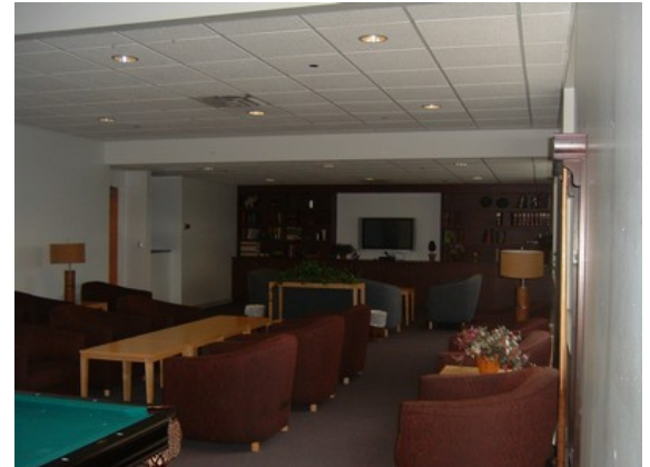
Clubhouse w/ Large Flat Screen TV and Pool Table